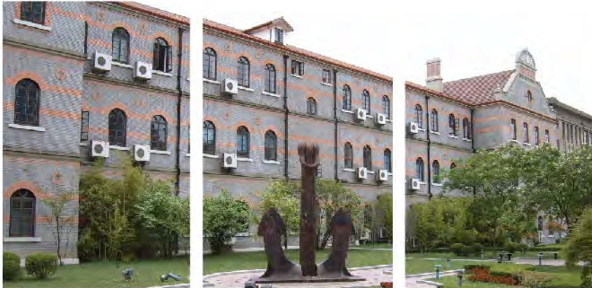
A Photograph about Xujiahui Campus of Shanghai Jiao Tong University

Shanghai, China; July 2 - July20; Full-Time Study Program