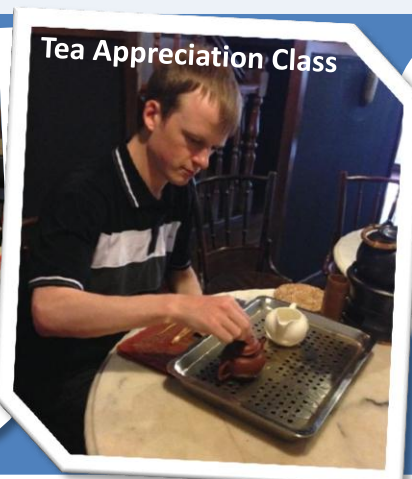
Tea Appreciation Class